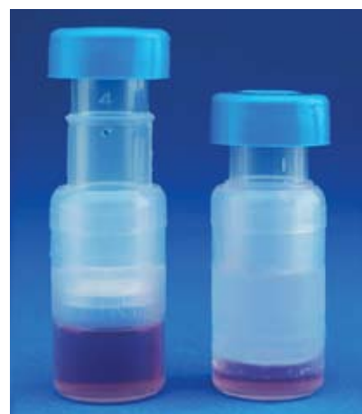
The Mini-UniPrep Syringeless Filter on the left is shown with fluid in the chamber. On the right, the filter plunger is shown compressed with the sample ready for analysis.