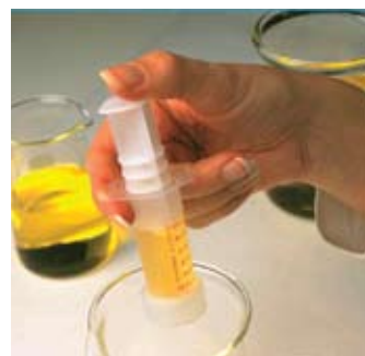
Fig 1. Easy to use one hand operation