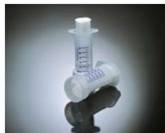
Fig 2. Autovial Syringeless Filters