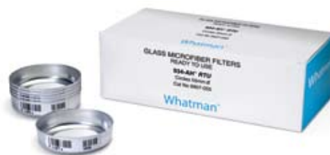
Fig 3. Whatman 934-AH RTU (Ready to use) Glass Microfiber filters for determining total suspended solids in water.

Total volatile solids is a measure of how much organic matter is present in effluent and an indication of bacterial levels. Measurement can be taken immediately after the total suspended solids determination. Residue on the 934-AH is ignited in a muffle furnace at 550°C. The loss in weight on ignition is measured in mg/l and indicates total volatile solids.