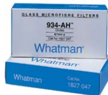
Fig 1. Whatman 934-AH Glass Microfiber filters are designed for the analysis of suspended solids.